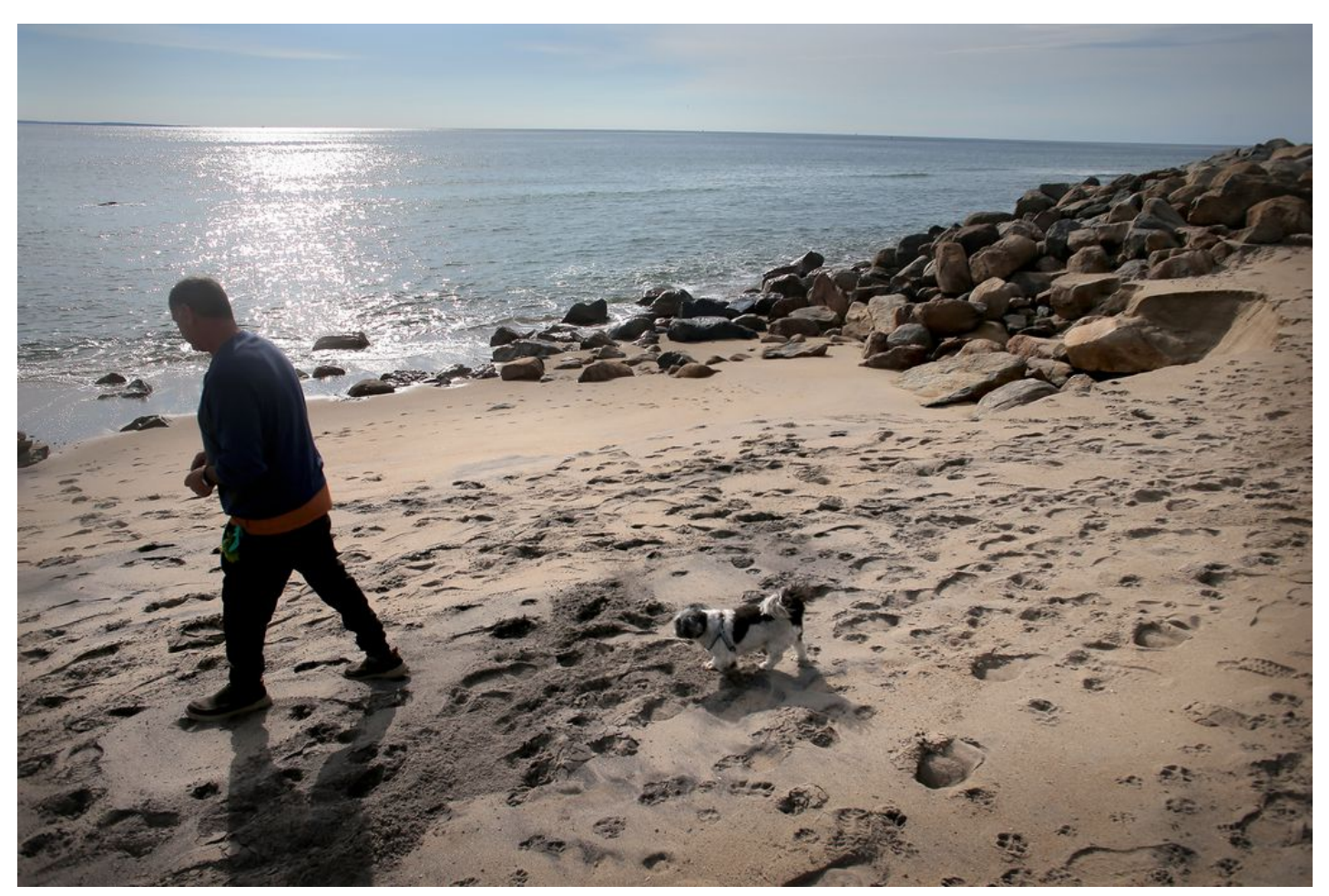
Bobby Kelly walked to the end of the accessible portion of Green Hill Beach in South Kingstown, where a property owner piled rocks down into the water, cutting off further lateral access. Coastal regulators with the Rhode Island Coastal Resources Management Council are tasked with protecting public beach access, often a contentious issue as private landowners seek to limit visitors.

By Brian Amaral Globe Staff, Updated March 3, 2022, 6:26 p.m.